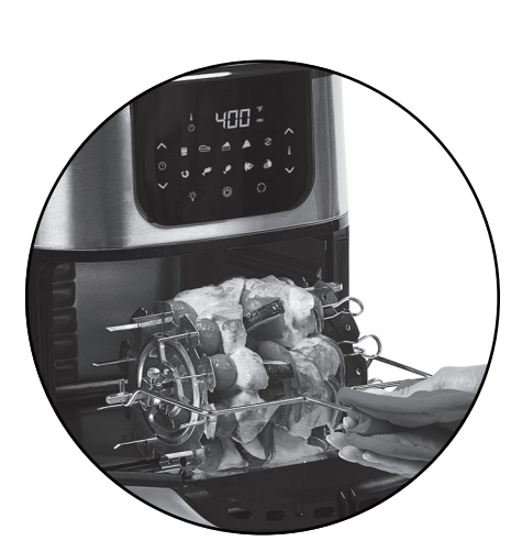
The fan will run for 20 seconds after the cooking time has expired to cool off. The Unit will then shut down automatically. Remove the Skewers from the Emeril Lagasse AirFryer Pro using the Fetch Tool or oven mitts and enjoy!