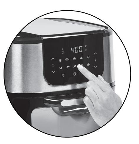
Select one of the one-touch cooking presets to begin the cooking cycle. If using manual settings, select the time and temperature and then press the Power/Start-Stop Button.