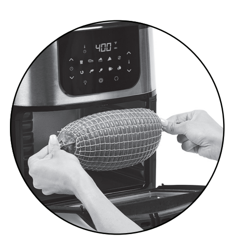
Carefully poke the Rotisserie Shaft through food and place the Rotisserie Shaft inside the Unit. For detailed instructions, please see the owner's manual.