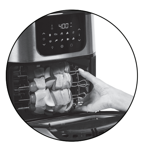
Carefully poke Skewers through food and insert them into the Skewer Racks making sure they're evenly spaced. For detailed instructions, please see the owner's manual. Place assembled Rotisserie Spit inside the Unit.