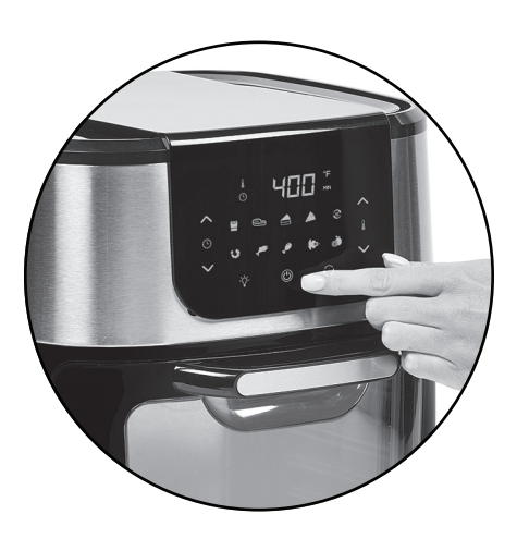
Make sure the Drip Tray is in place. Press the Power/Start-Stop Button to turn on the Emeril Lagasse AirFryer Pro.