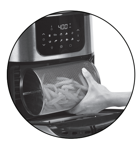
Put food into the Round Basket and place the Round Basket inside the Unit.