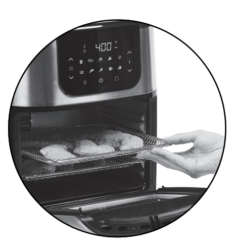
Arrange food on the Crisper Trays and place the Crisper Trays inside the Unit.