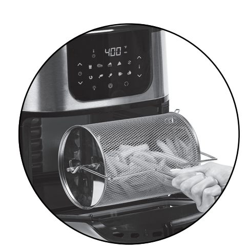
The fan will run for 20 seconds after the cooking time has expired to cool off. The Unit will then shut down automatically. Remove the Round Basket from the Emeril Lagasse AirFryer Pro using the Fetch Tool or oven mitts and enjoy!