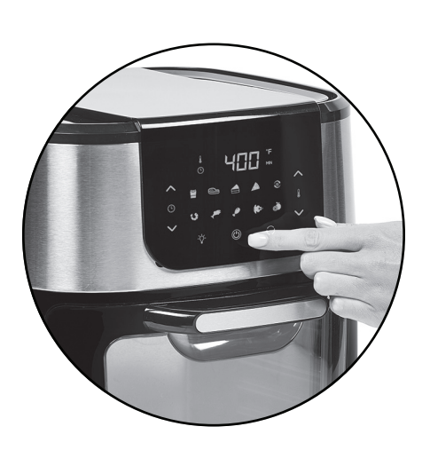
Make sure the Drip Tray is in place. Press the Power/Start-Stop Button to turn on the Emeril Lagasse AirFryer Pro.