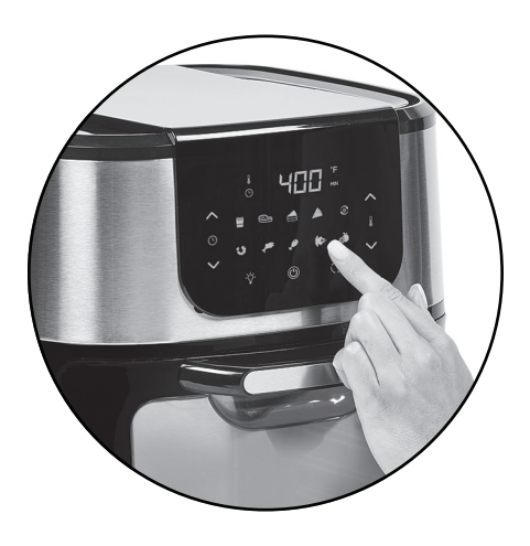
Select one of the one-touch cooking presets to begin the cooking cycle. If using manual settings, select the time and temperature and then press the Power/Start-Stop Button.