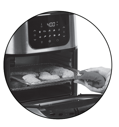
The fan will run for 20 seconds after the cooking time has expired to cool off. The Unit will then shut down automatically. Remove the Crisper Trays from the Emeril Lagasse AirFryer Pro while wearing oven mitts and enjoy!