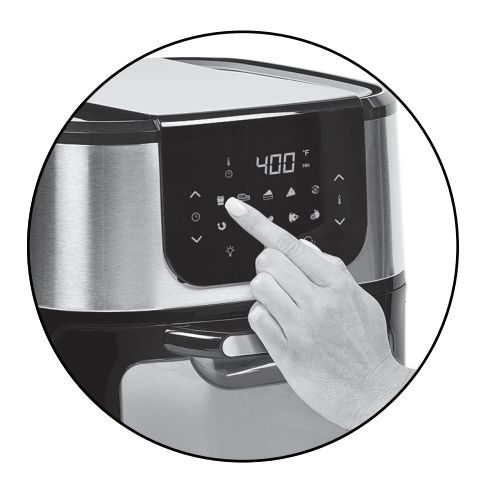
Select one of the one-touch cooking presets to begin the cooking cycle. If using manual settings, select the time and temperature and then press the Power/Start-Stop Button.