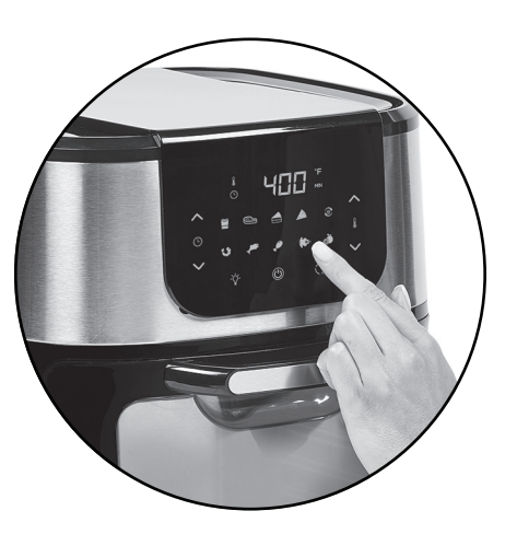
Select one of the one-touch cooking presets to begin the cooking cycle. If using manual settings, select the time and temperature and then press the Power/Start-Stop Button.